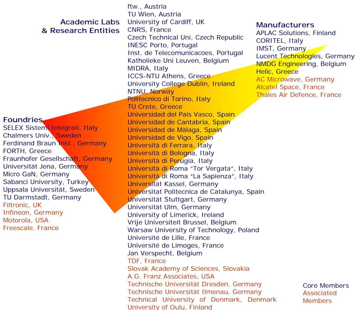
Fig. 1-2: The TARGET consortium

The TARGET network maps the needs of microwave power amplifier and transmitter design seamlessly onto its consortium, as depicted in Fig. 1-2. The consortium consists of semiconductor foundries, of academic labs, and of system manufacturers, where the industrial partners are mostly associated members. It is exactly this combination of top players in the field of broadband wireless access which will generate decisive impulses to European research and the development of technology.